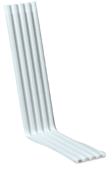
L-shaped weeps create weep tunnels directly on flashing

Weeps above a window in a thin stone veneer