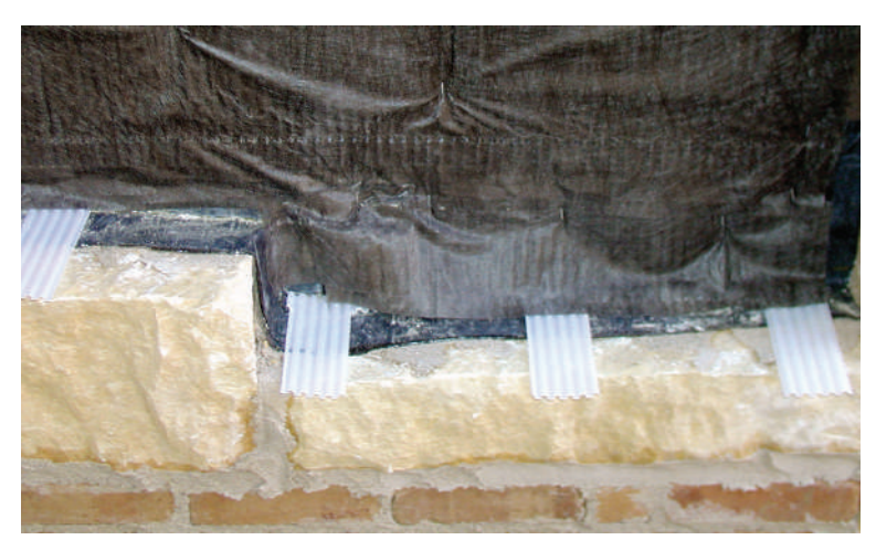
Wall Opening Weeps with Sure Cavity on natural stone